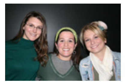
Purdue University's ON TRACK crew

the profession. All three of the university counselor education programs are accredited by the Council for Accreditation of Counseling & Related